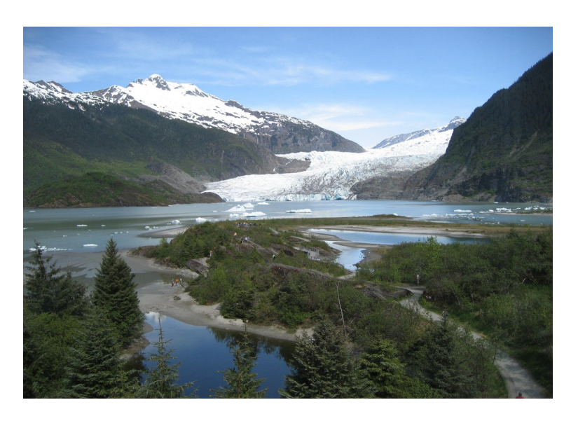
Mendenhall Glacier, Juneau AK 2010 Join us on Voyage Alaska May 2020 to see what Mendenhall looks like today.