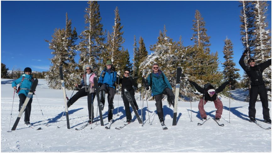
Back Country Ski Lessons Students on Break