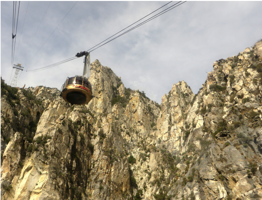
Palm Springs Tram