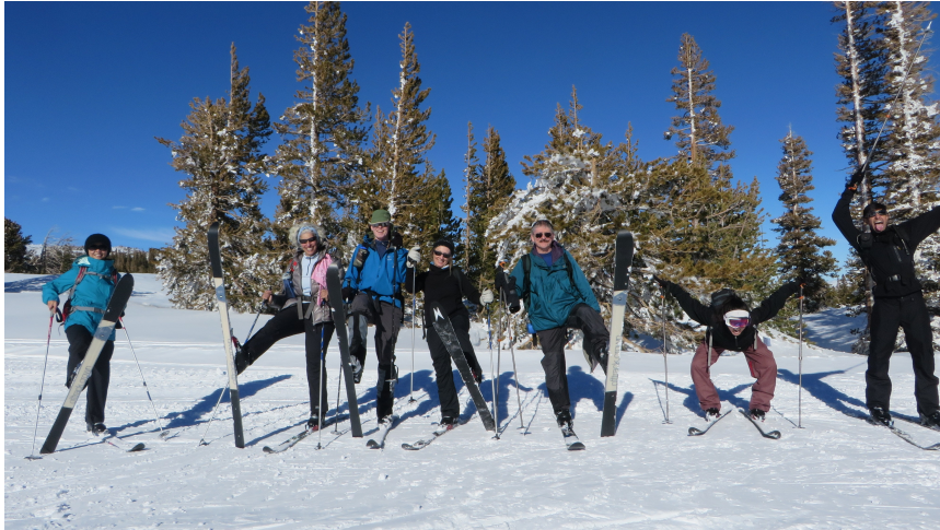
Back Country Ski Lessons Students on Break