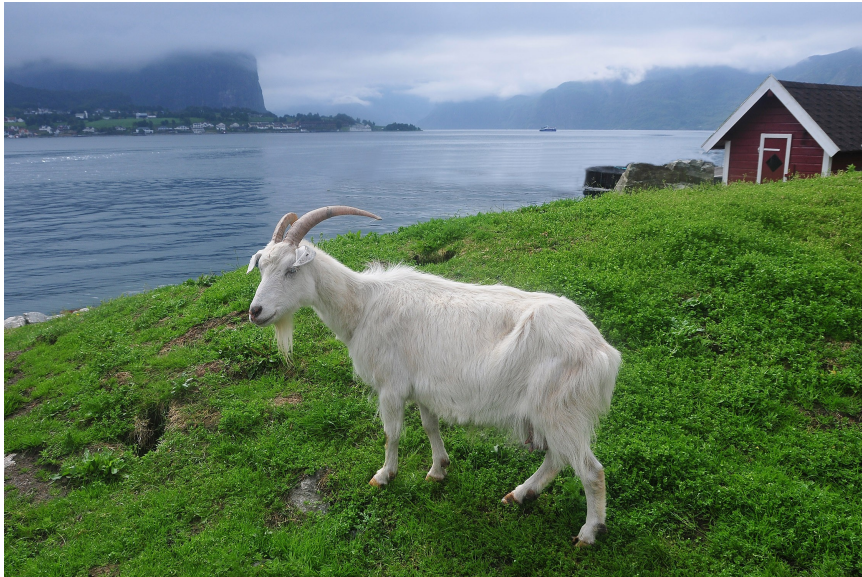
Norway Fjord Native