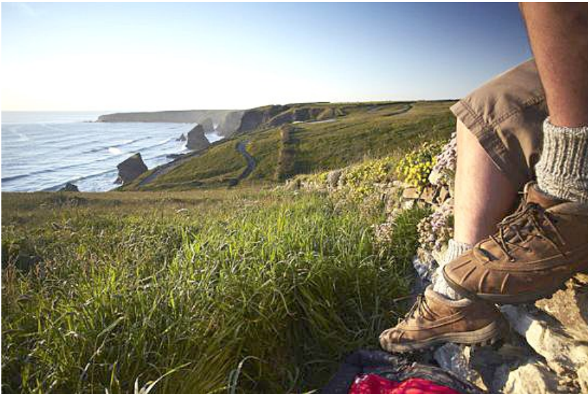
Bedruthan Steps, Cornwall