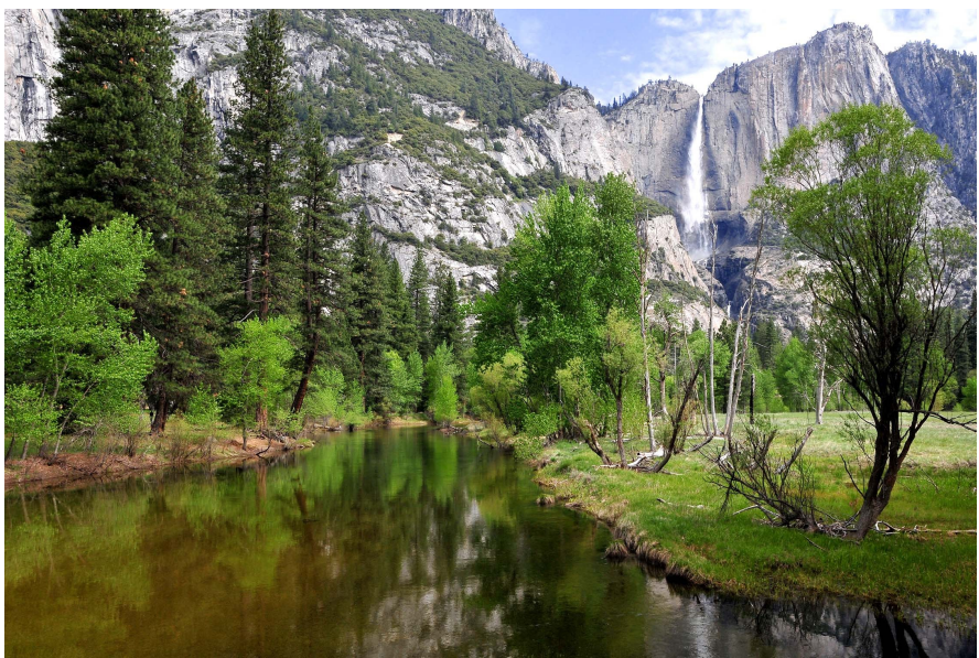
The Sierra Club at 125 Years: From Yosemite to Climate Change - See page 5

Check out our Schedule of Activities inside this issue: Conditioning Hikes& Local Hikes Hike for Conservation – Bolsa Chica Ecological Reserve,