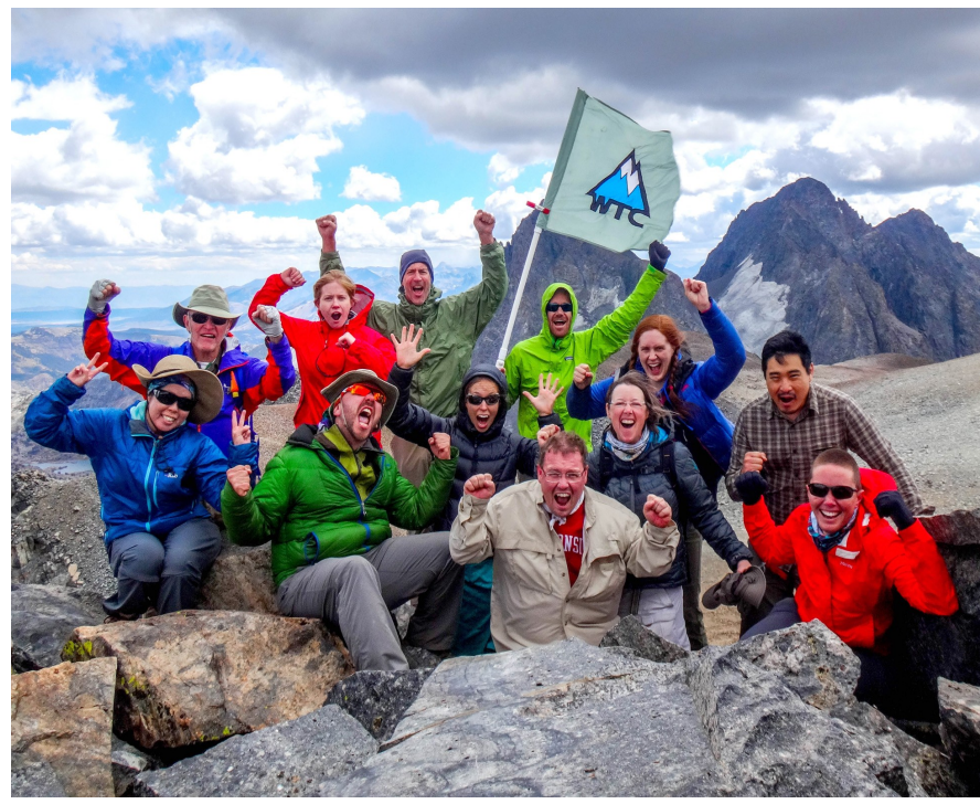
Join us for WTC program Aug 14, 2017 REI Tustin!