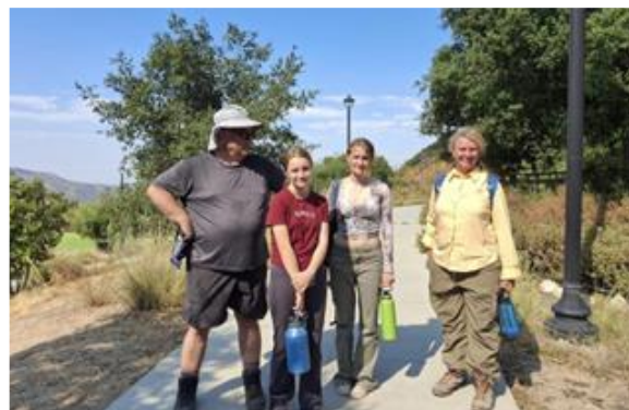
CV group picknickers preparing to water trees during summer brunch picnic on Sept 8 th .