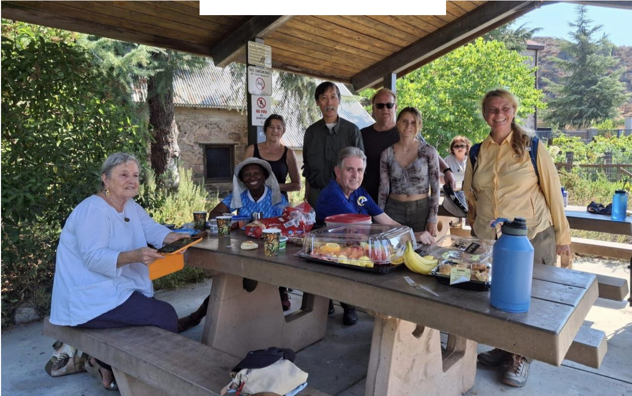
Members of the CV group enjoyed the picnic which took place Sept. 8 th at Deukmejian Wilderness Park in Glendale.