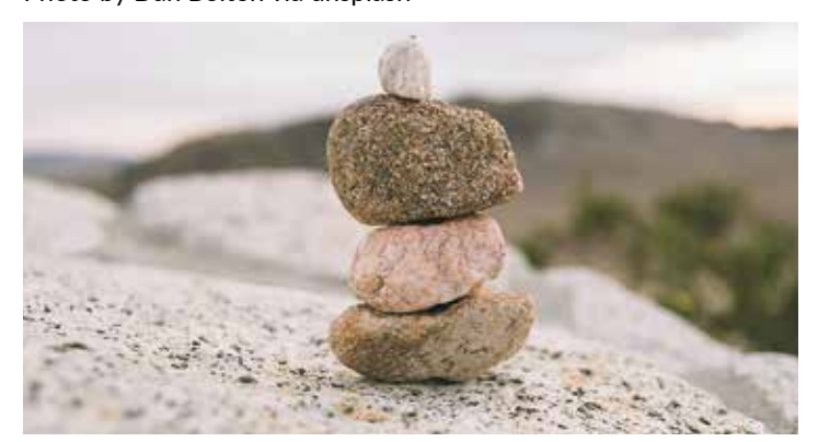
Anza-Borrego State Park, CA