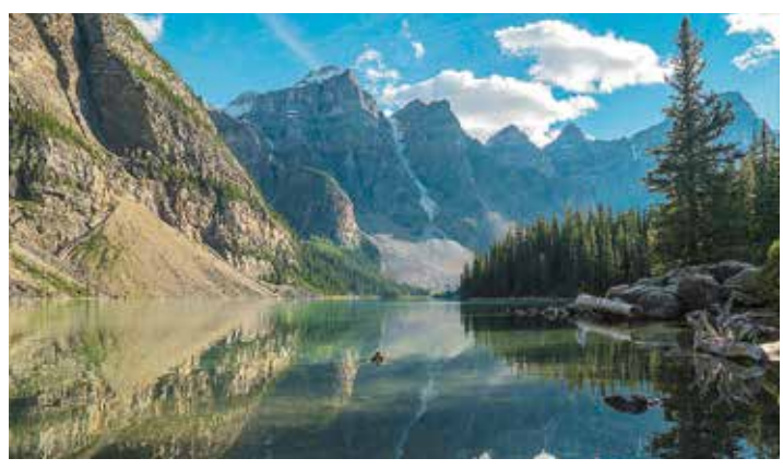
Lake Louise, CA

California Sellers of Travel # CST 2087766-40 Registration as a seller of travel does not constitute approval by the State of California