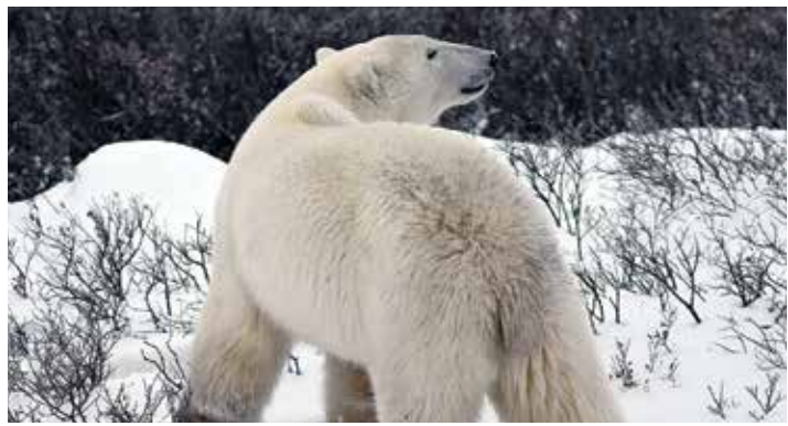
Polar Bear Adventure at Churchill, Manitoba, CA