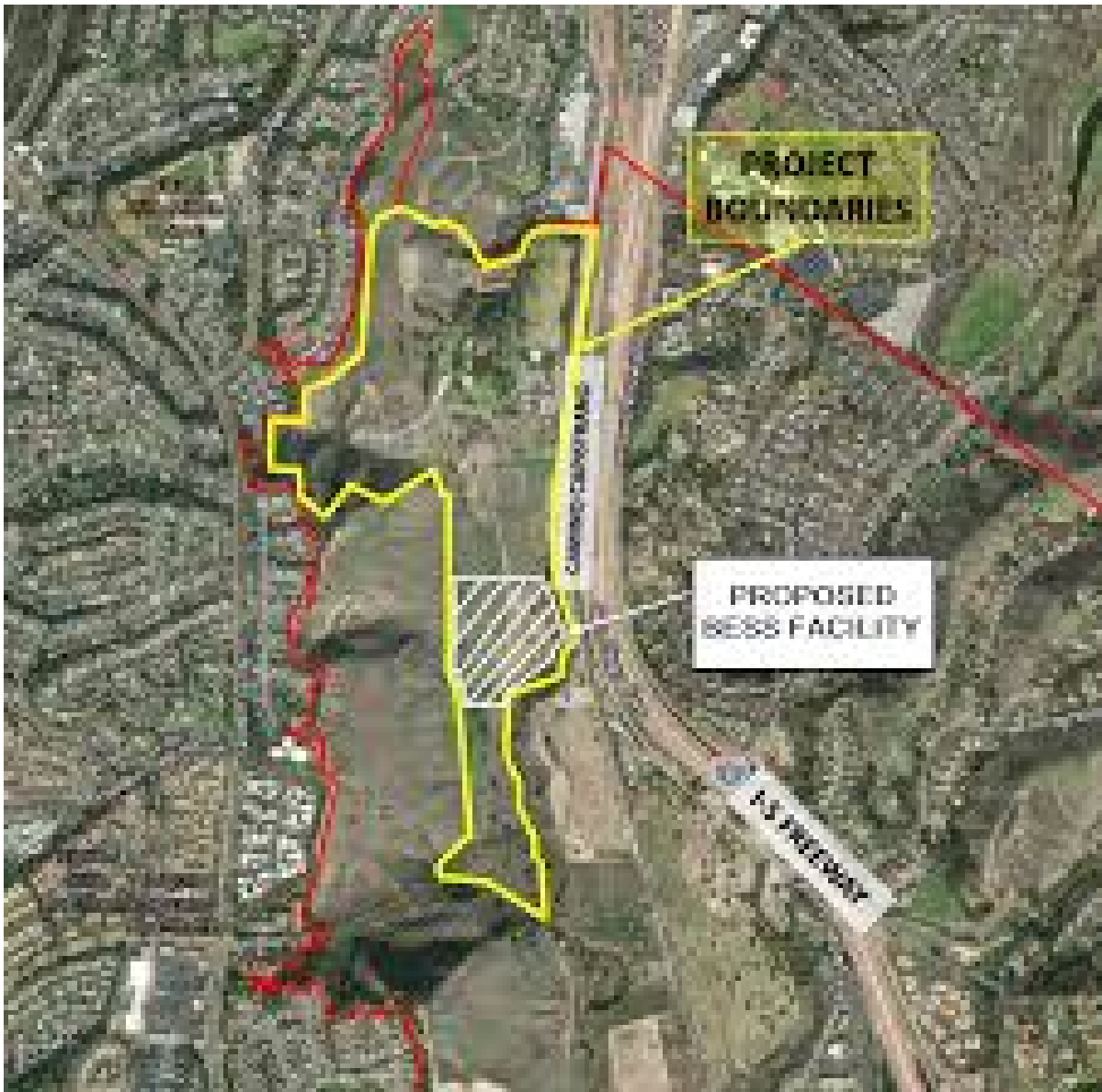
© City of San Juan Capistrano

A major battle is brewing in San Juan Capistrano over an electric battery facility. This is an important environmental issue pitting local public safety concerns against dire global needs.