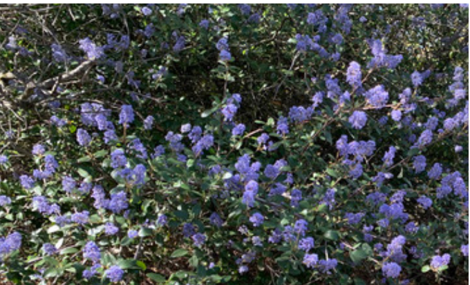
That is John Kaiser in the top picture. The purple flowers are Ceanothus.