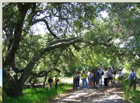
O'Neill Park Hike