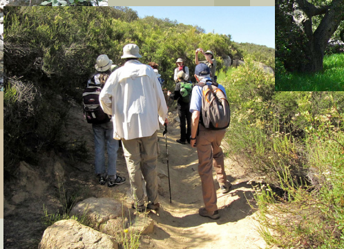
The Morgan Trail in the Cleveland National Forest