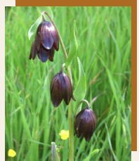
Chocolate Lily, Santa Rosa Plateau

("Outings" continues on the next page...)