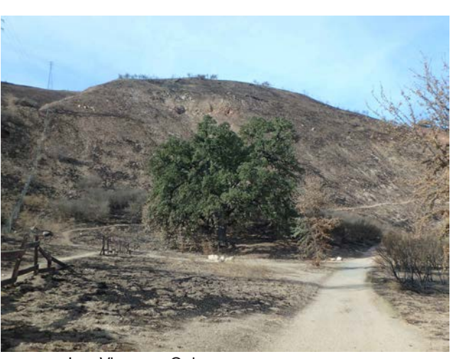
Las Virgenes Oak

Although it is somewhat distressing to look at, here are some photos I took. We will be on these trails again soon, witnessing the regrowth as it progresses. The wildflowers next Spring should be spectacular. ■