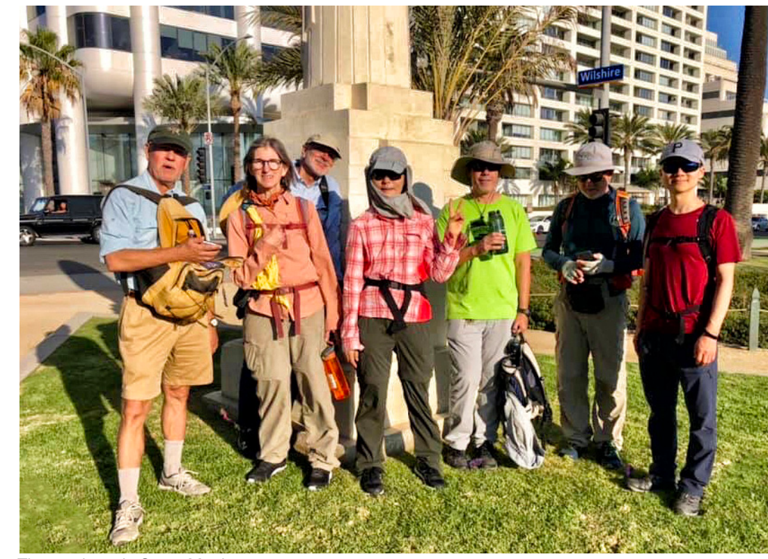
The survivors in Santa Monica.

We all had a wonderful day and are eager to share this experience with you next year. ■