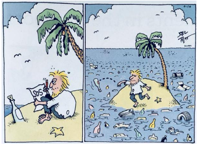
Sierra Club's Cartoon on Ocean Litter

"The goal of the public and business education program shall be to target 100% of the residents, including businesses, commercial and industrial establishments," stated in Santa Ana Water Board's Municipal Separate Storm Sewer Systems (MS4) requirements. 100% coverage is easier said than done. Yet, for education to stick to the mind and lead to change, one has to re-learn the same message multiple times through multiple methods. The process has to be fun. It's possible. With all the talents brought by a joint effort of various types of partners, we can save the ocean.