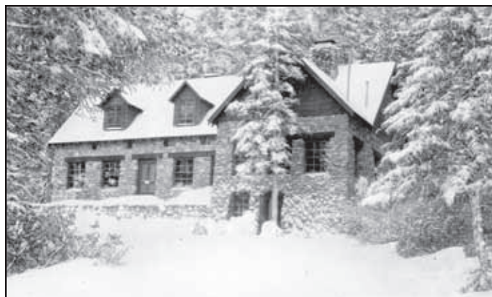
Harwood Lodge in the winter, Angeles Chapter archives.

These events are at Harwood Lodge, the Chapter's beautiful 1930s mountain retreat located at 6000' feet elevation near several trailheads on the edge of Mt. Baldy. Harwood is open to Sierra Club members most weekends from Sat at 10am to Sun at 3pm. For specific dates listed here, check the Daily Schedule by date. Or visit Harwoods website for more information: http://angeles.sierraclub.org/lodges/harwoodlodge.html .