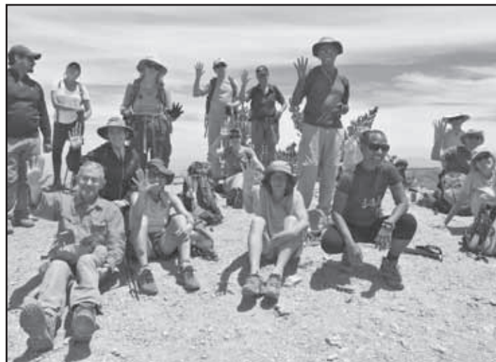
Sierra Club hikers and leaders atop Mt. Baden Powell.