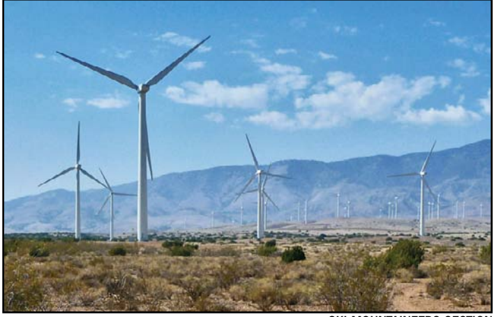
SKI MOUNTAINEERS SECTION

Windmills along the Pacific Crest Trail.