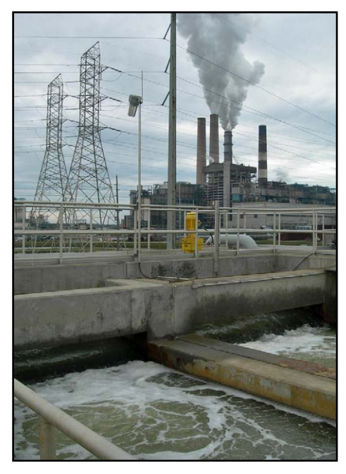
A desalination plant in Tampa Bay, Fla.

In a 2008 report, the California Air Resources Board noted that a way for the state