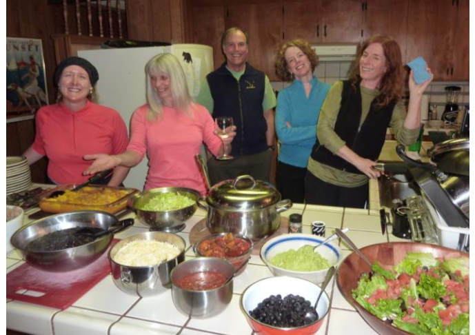
Successful meal preparation

Both nights we all returned to the cabin and together cooked up meals using fresh and healthy ingredients. No one went away hungry.