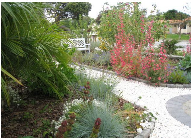
“Out went the lawn and in marched the natives.”

It is a sensual garden. Vibrant pastel colors most of the year, and a variety of greens and textures in the winter, keep the eye roving over its living mounds. Flocks of tiny birds invade the Island Mallow in chirpy cascades. Bees and insects hum a busy tune enticing enough to help us ignore the noisy street. The scent of the sages salutes us as soon as we let the breeze come into the house in the morning and welcomes us back home as we enter the driveway in the evening.