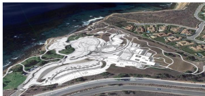
Construction plans for Lower Point Vicente Park, showing limits of open-space for public outdoor recreation.

Following up that letter, the PV-SB Group of the Sierra Club sent a letter to the NPS applauding their vigilance in protecting this coastal headland. (Excerpt, Page 8.)